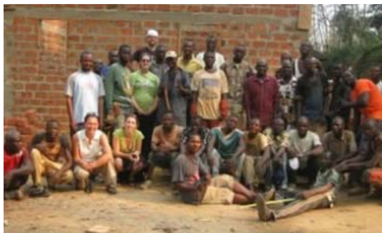
The PRECI team at their worksite in the Democratic Republic of Congo