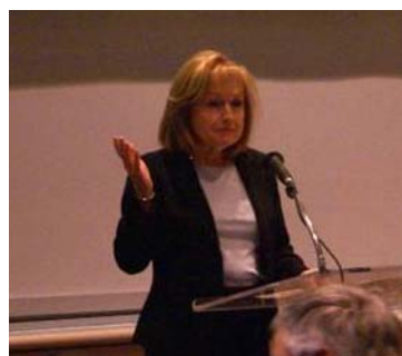
Honourable Madeleine Meilleur, Minister Responsible for Francophone Affairs

In the beautiful premises of la Cité Collégiale, a one day symposium was held on the relations between Ontario and Francophone Africa. Chaired by the Honourable Madeleine Meilleur, Minister Responsible for Francophone Affairs, under the organization of the Office of Francophone Affairs and in collaboration with the Canadian Foundation for the Dialogue of Cultures, the Collective Cube and the Canadian Council for Africa shared on relations between Ontario and Africa to make this relationship a safe bet for the future.