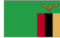
His Excellency Dr. Nevers Mumba High Commissioner-designate for the Republic of Zambia