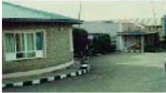
Diredawa Ras No. 1