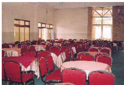
Addis Ababa Ras Hotel (above)

Visit our conveniently located hotels in various parts of the country during the Ethiopian Millennium