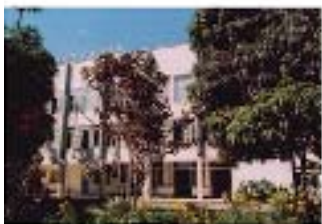
Kereyou Lodge Ras