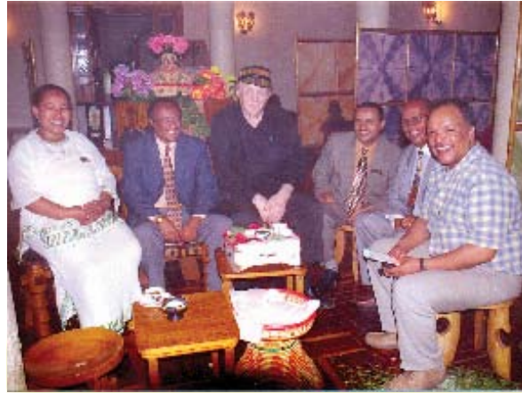
Ras Hotel Traditional Restaurant (above)