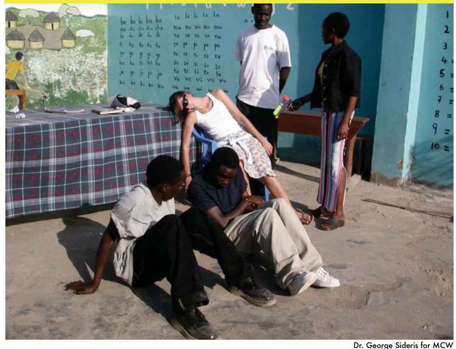
Tanzanian and American youth act in a scene from a play on drug abuse in Arusha.