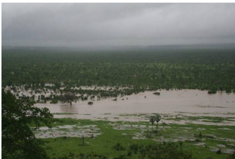
Sinamatella River in flood below camp. (Stephen & Sue Long)