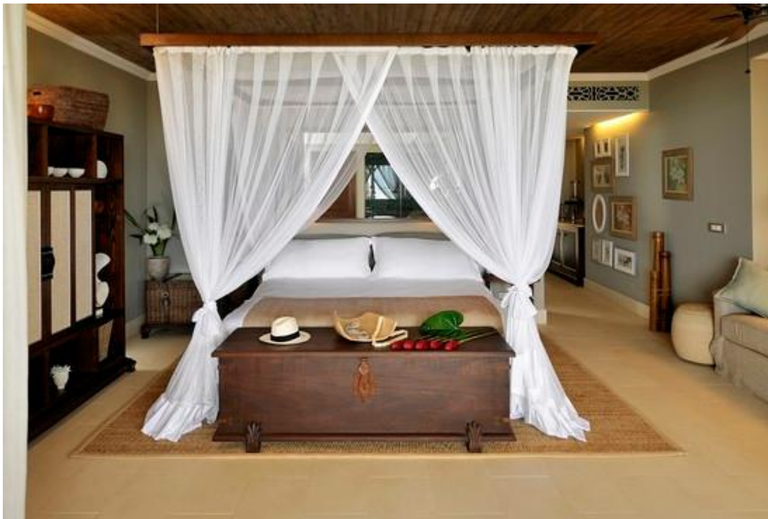
(Picture courtesy of St. Regis Mauritius picture, showing a sample bedroom)