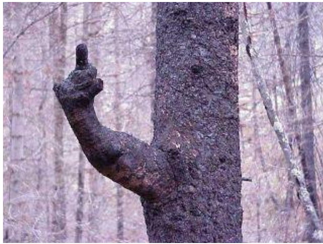
( – given the title ' The Forest Fights Back ' by this correspondent)

This week the world celebrated the International Forest Day and, I guess true to form, I felt the time was right to dedicate some thoughts to the forests in our region. In Kenya politicians pondered for the past 5 years how to restore the Mau Forest, and others, to their crucial functions as water towers. In Tanzania illegal logging is now worse a problem than poaching, and that is out of control as it is, and the seizure of a freight train last week packed with illegally logged timber shows how deep the collusion has reached, when entire railway trains can be converted into ferrying the loot.