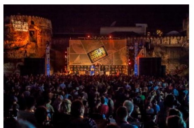
(Impressions from the 2013 edition of Sauti za Busara)

Zanzibar has become the ' en vogue ' destination in East Africa with a number of top ranked resorts available for discerning travelers though accommodation facilities are available to suit all pockets. Flights from Dar es Salaam are operated by Precision Air, FastJet, Coastal Aviation and a number of other airlines and there are daily ferry connections between the mainland and the island of Unguja, Zanzibar's main island where the festival is staged. Make a date with Zanzibar and Sauti za Busara 2014 and see the impressive lineup of performers, but in view of the advanced time, make that date as fast as you can.